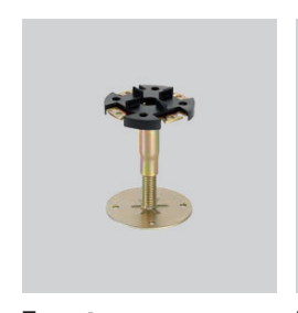
Type 4 1-part individual pedestals up to 200 mm